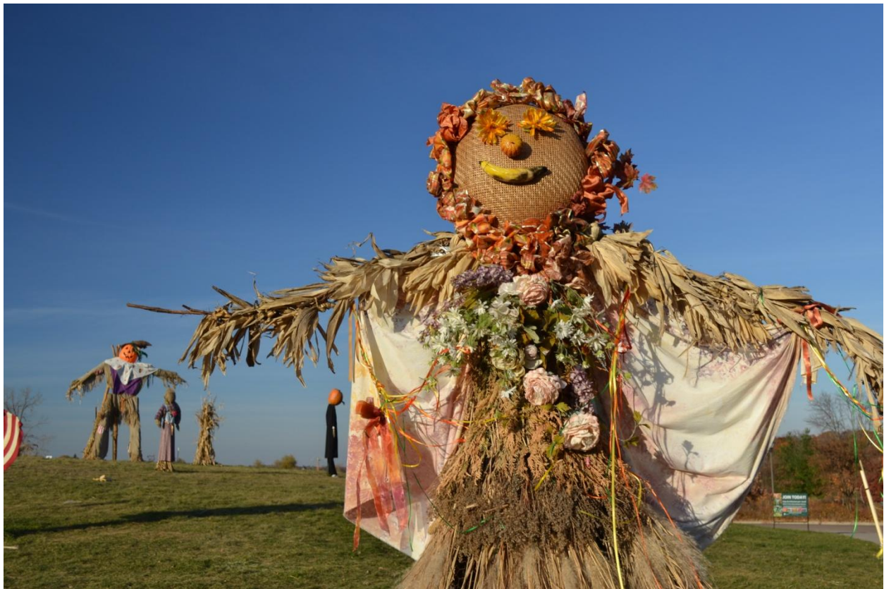
The Scarecrows on the hill at the Minnesota Landscape Arboretum