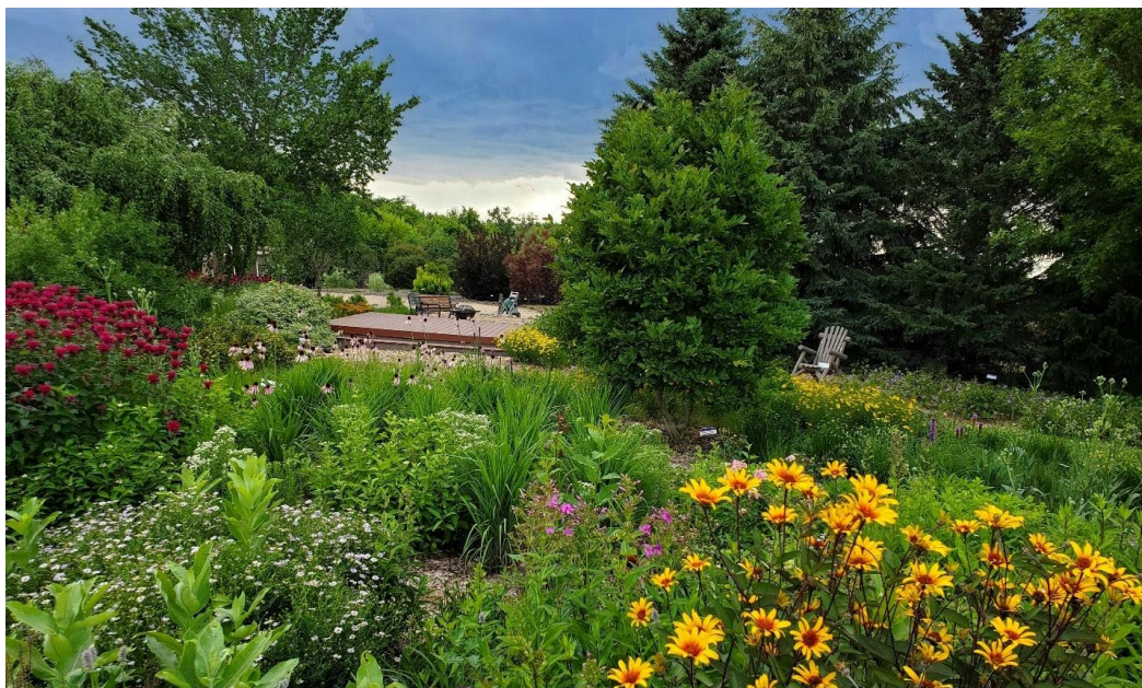
A view from the top of a berm

Rebecca Patient arranged a tour of Nord Farm for our July tour. This propagation farm features a display garden of ornamental perennials, shrubs, and trees, and that's where we spent our time. The garden was re-designed a few years ago, and it looked like it has been established long before that. The designer followed principles of designing plant communities, as described in Planting in a Post-Wild World by Thomas Rainer and Claudia West.